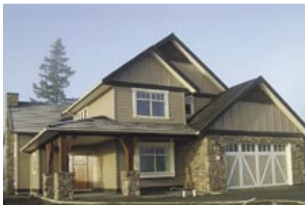
Monterra Developments Show Home

they will continue to build homes within the Crown Isle community, along the extension of Idiens Way and Suffolk Drive. Thirty-seven new lots will be built on both sides of Idiens Way and these lots are expected to be completed in the summer. Benco and Monterra plan to begin construction in the fall on the new phase.