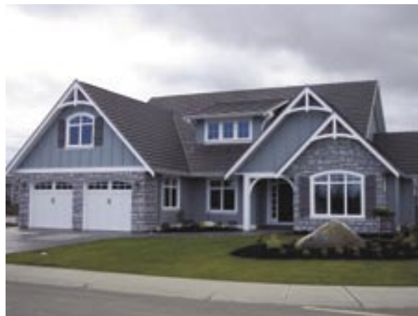
Benco Ventures Show Home

Both Benco Ventures and Monterra Developments are pleased to announce that